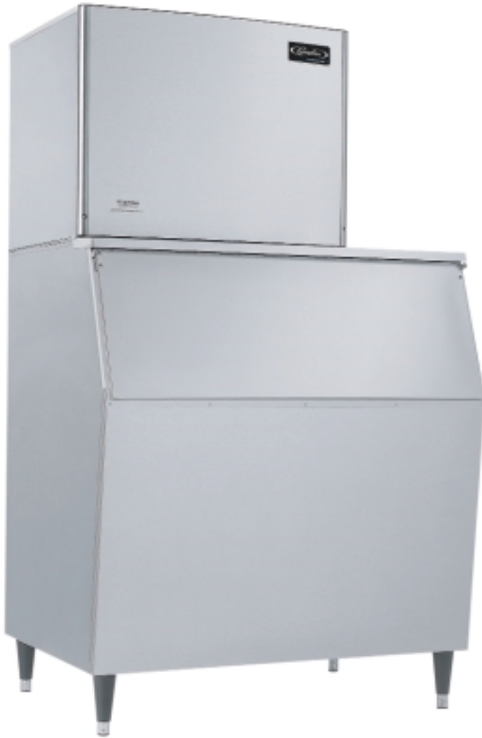
Model 630 shown